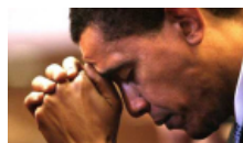
Obama, the first communist president?