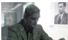
The sad story of Alan Turing