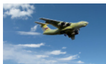
Il-476: unique plane with large export potential