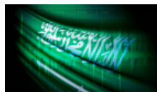
Geidar Dzhehal: 'Now it's Syria and tomorrow will be Saudi Arabia'