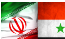
Iran to build new missile defence base

Anonymous hacktivists to launch TYLER: "WikiLeaks on steroids!" – EXCLUSIVE interview, part 1