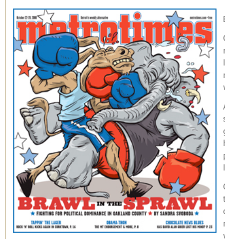
MT ILLUSTRATION: SEAN BIERI

As metro Detroit's richest county looks more and more like America, close observers sense change coming